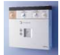
Convenient Remote Control