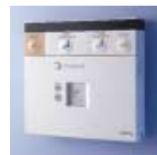
Convenient Remote Control